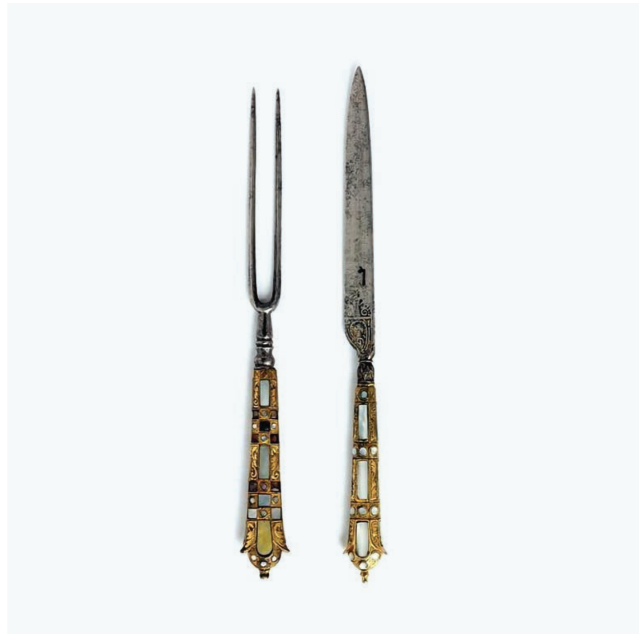
Steel French forks dating from the late 1500s to the early 1600s, with mother-of-pearl and beads.