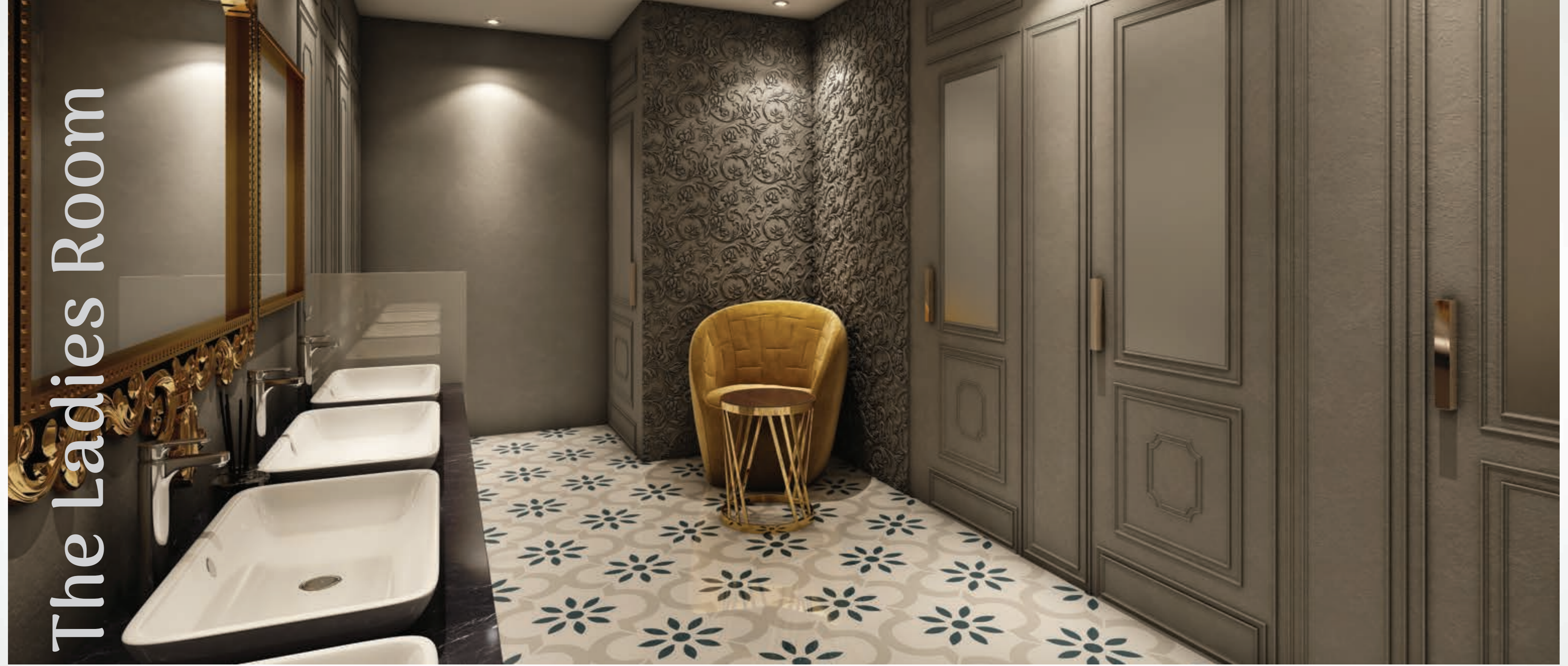
The Ladies Room