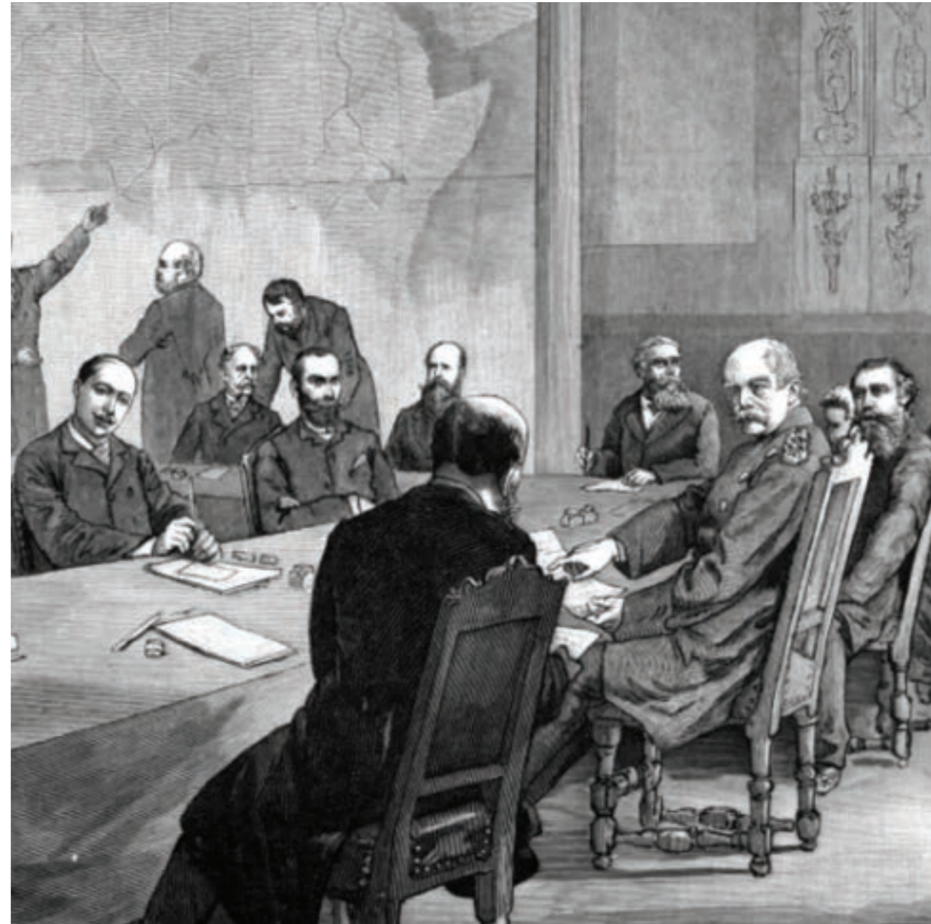
A conference is generally understood as a meeting of several people to discuss a particular topic. It is often confused with a convention, colloquia or symposium. While a conference differs from the others in terms of size and purpose, the term can be used to cover the general concept. The picture above shows a section from 'The conference of Berlin, as illustrated in 'Illustrierte Zeitung', 1884'.