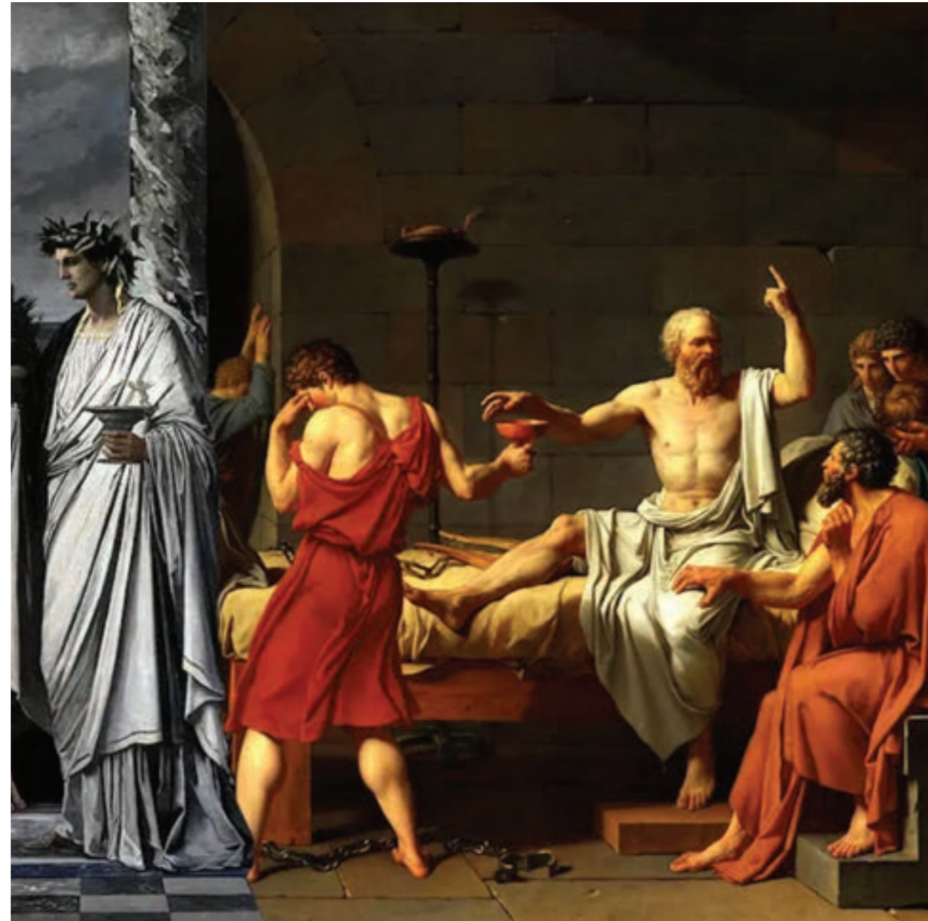
A symposium was a social gathering in ancient Greece. At symposia, male citizens would gather for dinner, drinking, conversation, music, and entertainment. The Symposium was a key aspect of ancient Greek culture immortalized in ancient pottery and the works of Plato and Xenophon. Most famously, in Plato's Symposium, Socrates discusses the nature of love as he drinks wine with a group of friends.