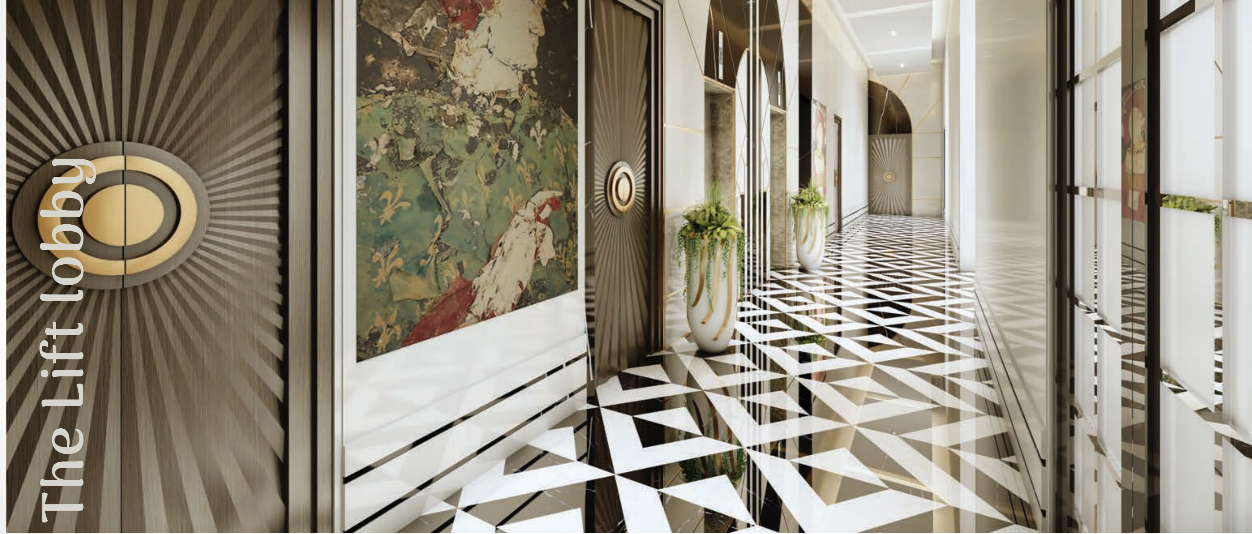
The Lift lobby