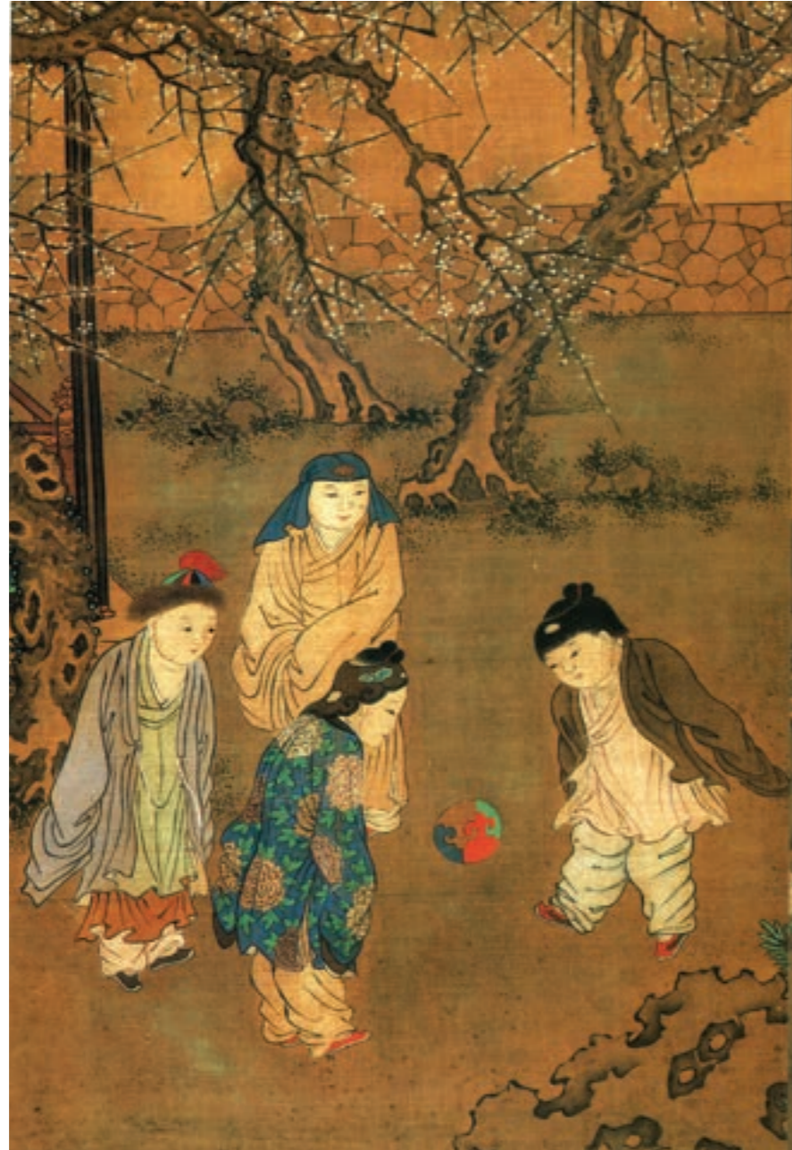
Children playing cuju (like soccer) in Song dynasty China, 12th century.