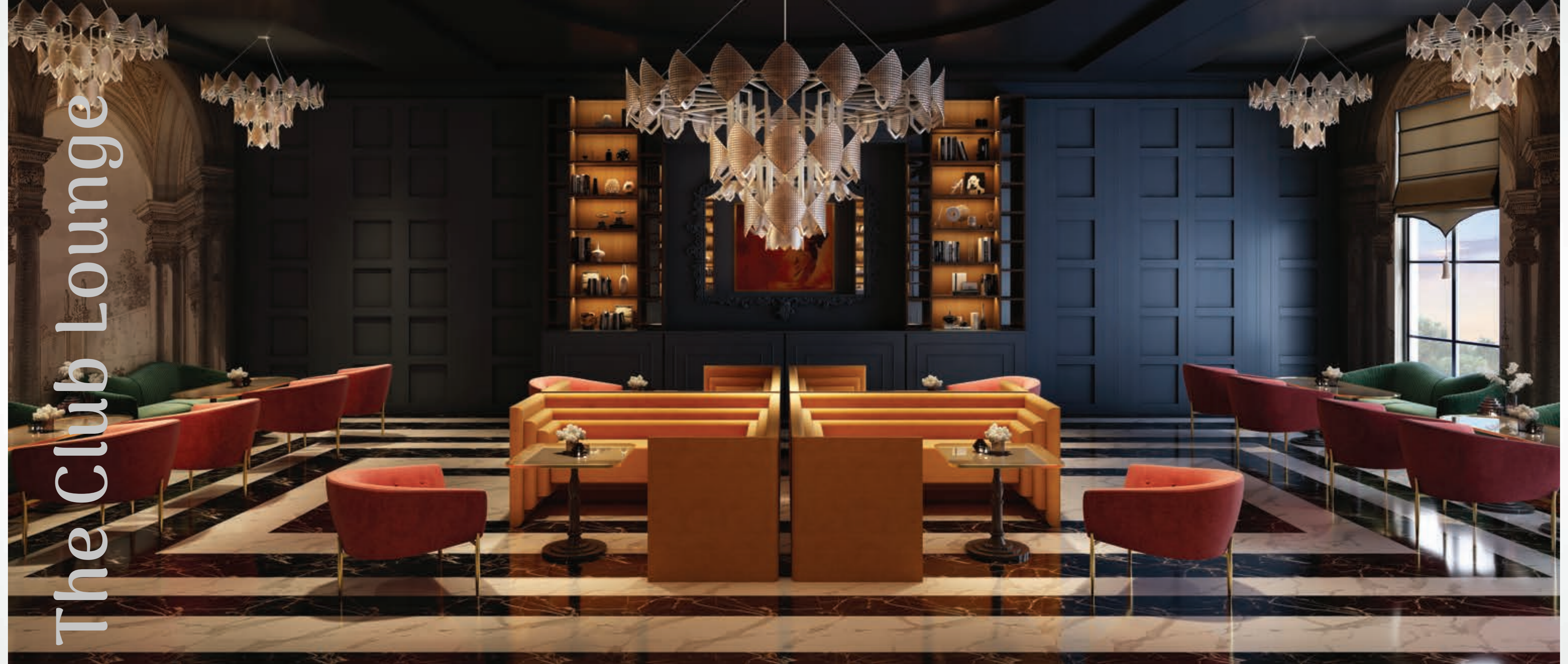
The Club Lounge