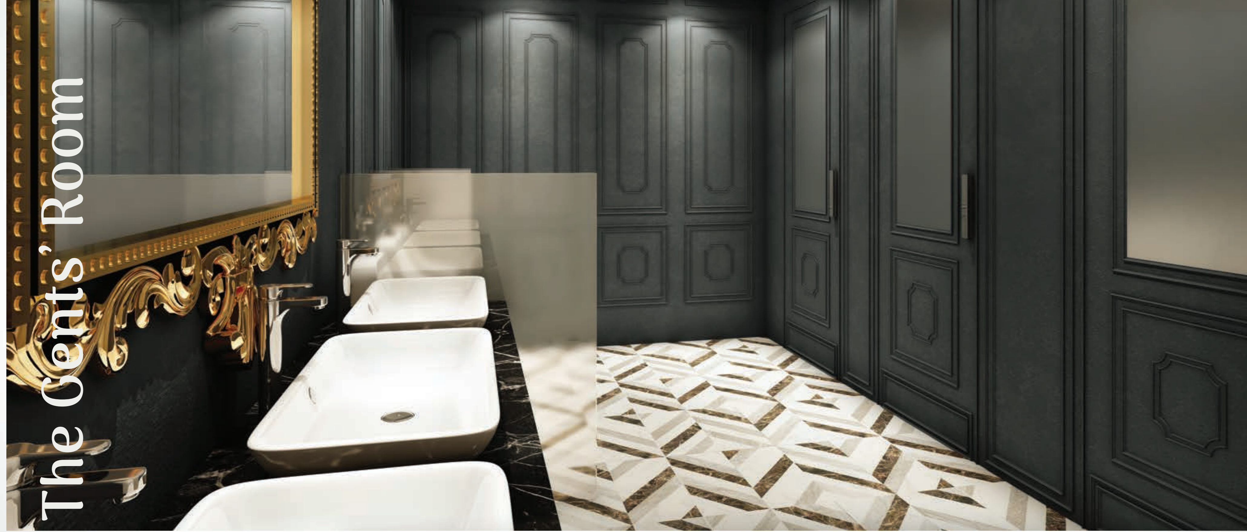
The Gents' Room