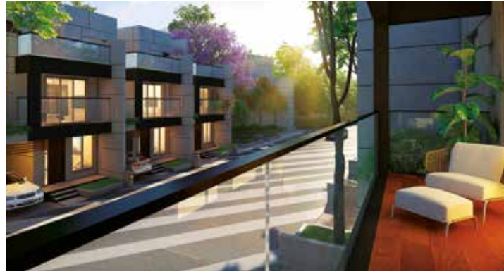
BOTANICA bungalows near Southern Bypass