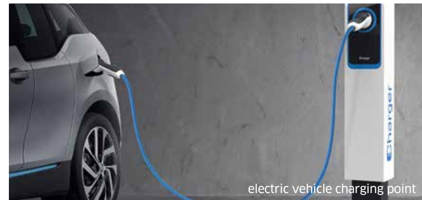
electric vehicle charging point

With rising fuel prices there is and will be a propensity to shift to renewable resources for vehicles. Which is why, the usage of electric vehicles are on the rise. A platinum rated property will have to have electric vehicle charging points to provide occupants the provisions to charge electric vehicles at an extra cost.