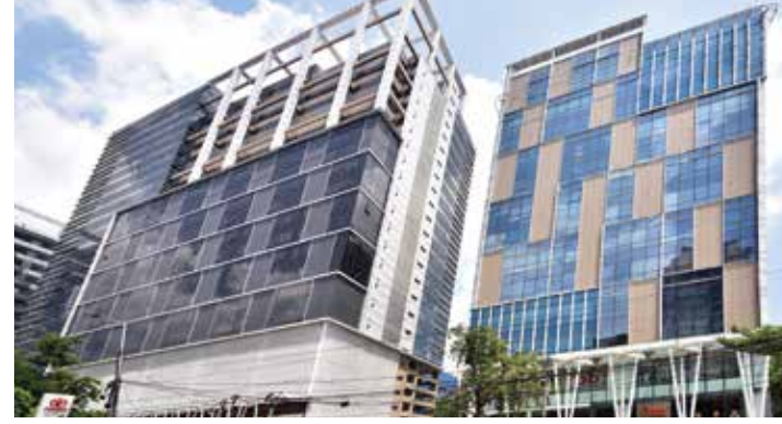
SRIJAN CORPORATE PARK Sector V Salt Lake