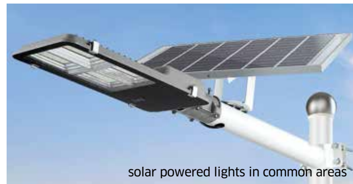
solar powered lights in common areas