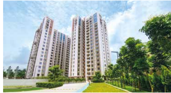
OZONE on South EM Bypass