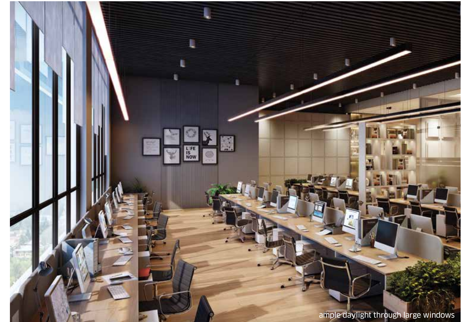
ample daylight through large windows