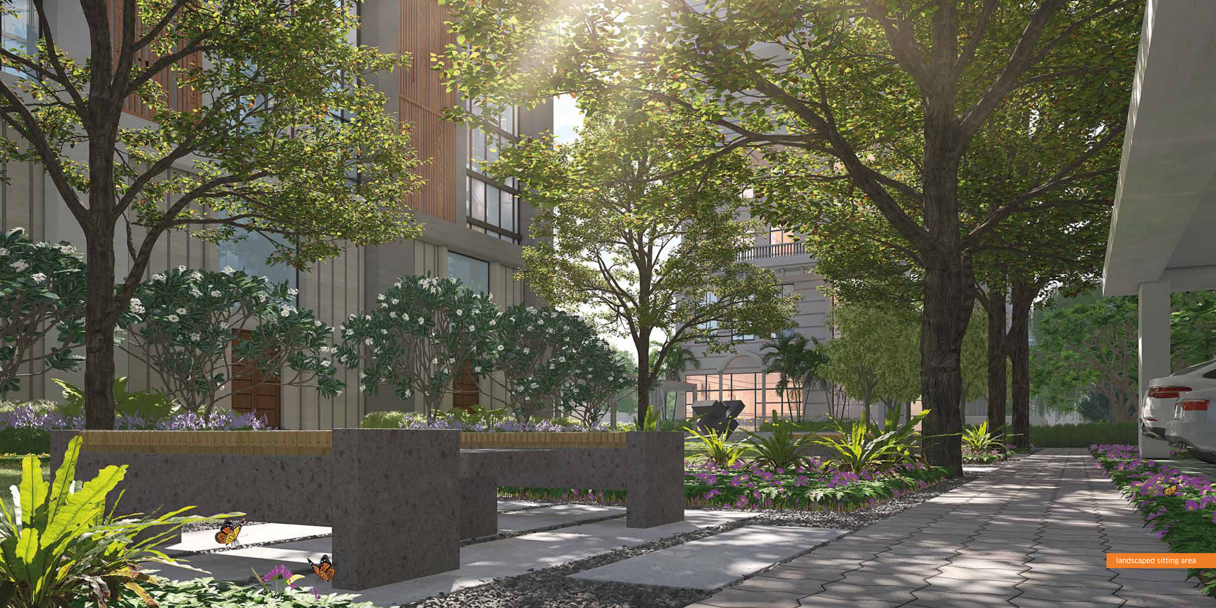
landscaped sitting area