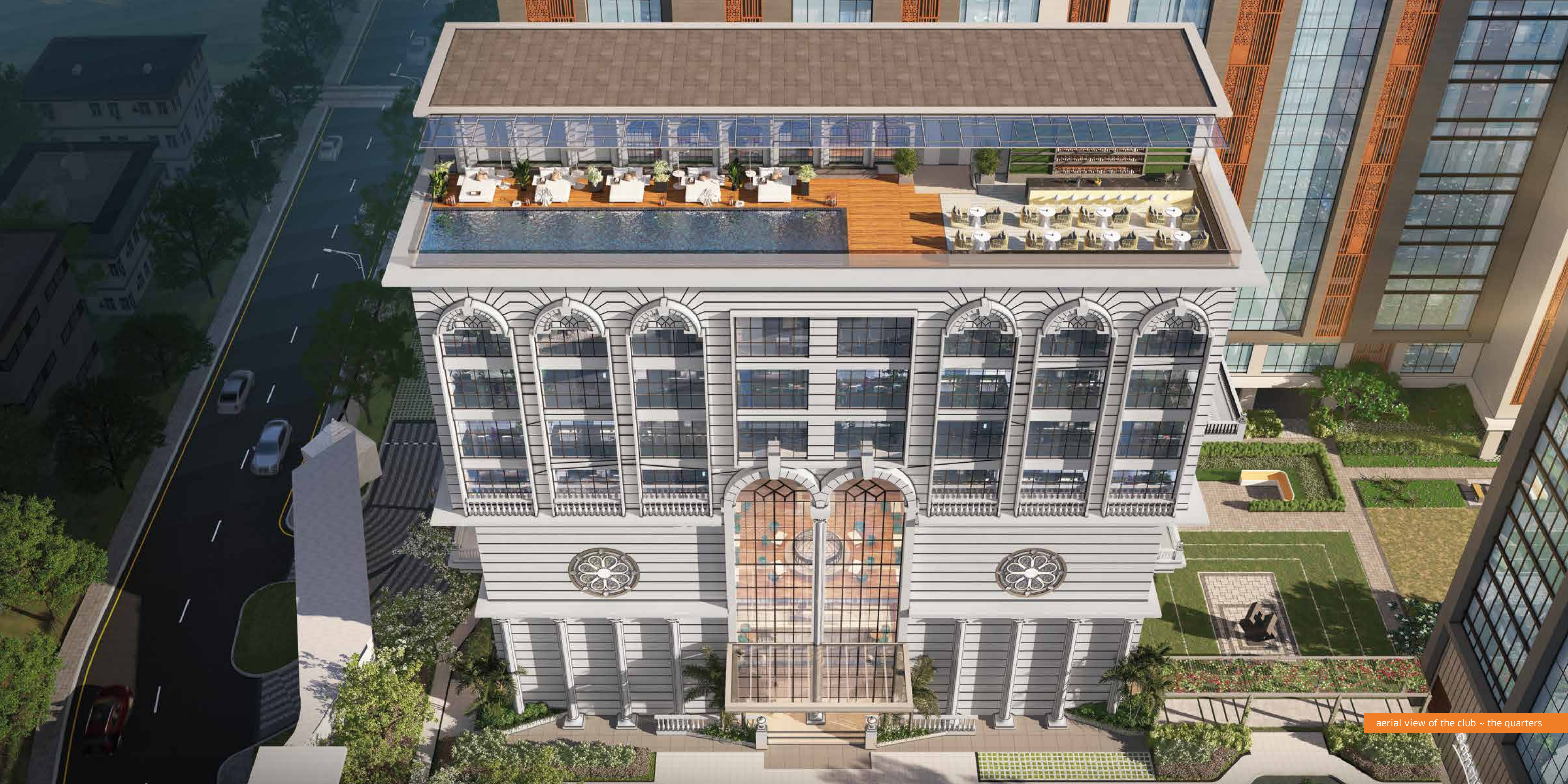
aerial view of the club ~ the quarters