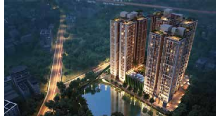
LAGUNA BAY near Science City