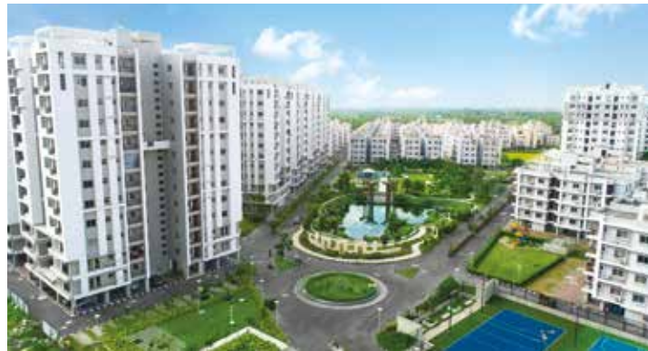
GREENFIELD CITY near Behala Chowrasta Metro