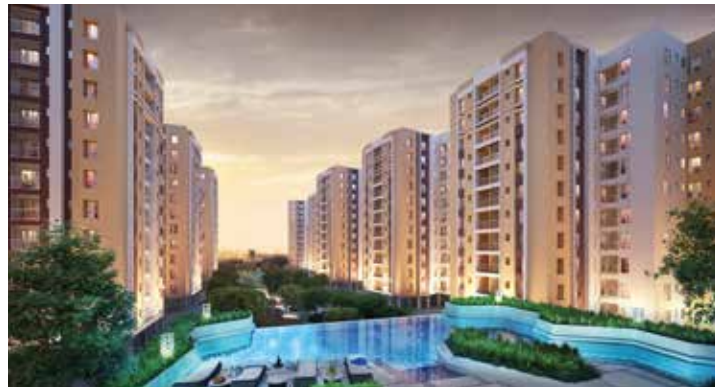
ETERNIS on Jessore Road