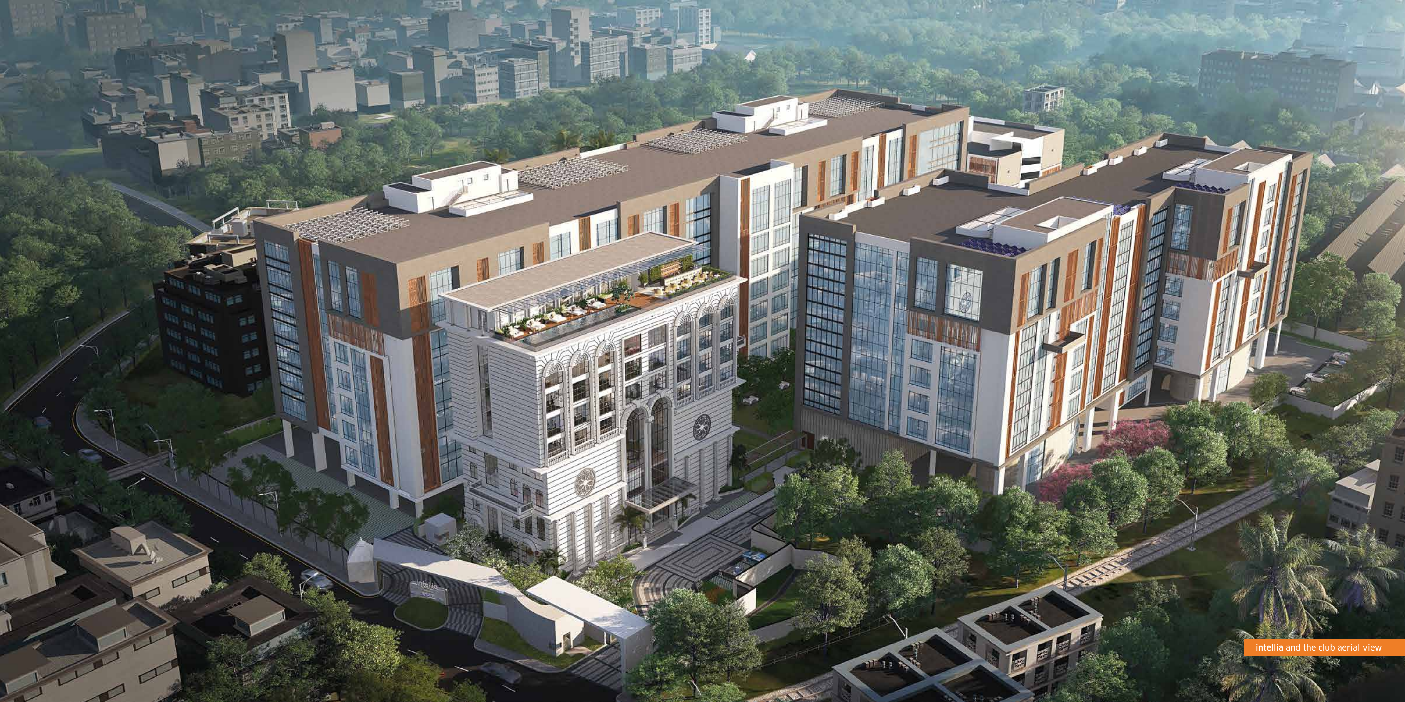
intellia and the club aerial view