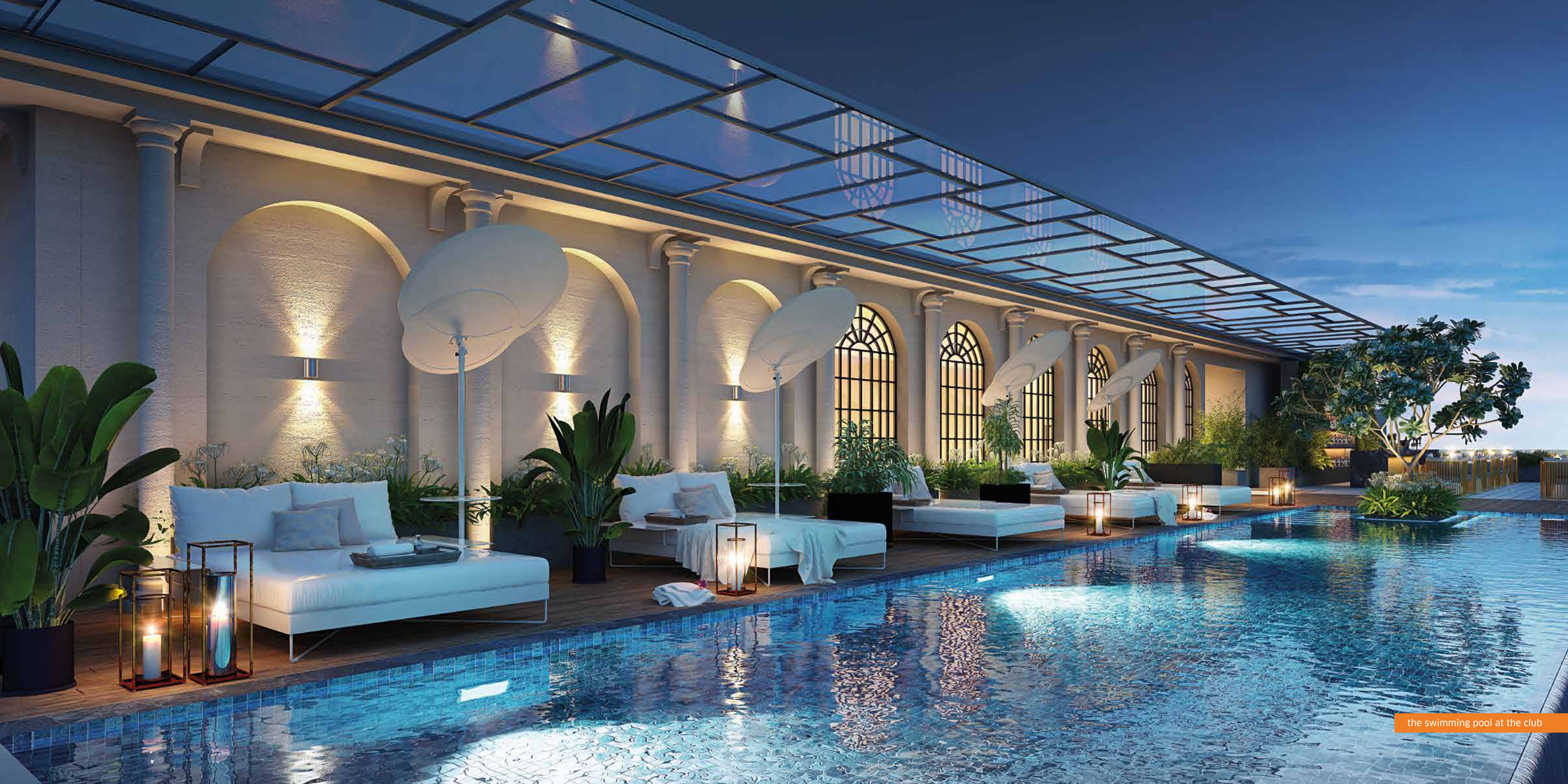
the swimming pool at the club