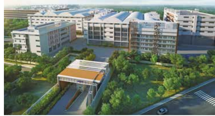
SRIJAN INDUSTRIAL LOGISTIC PARK on NH 6