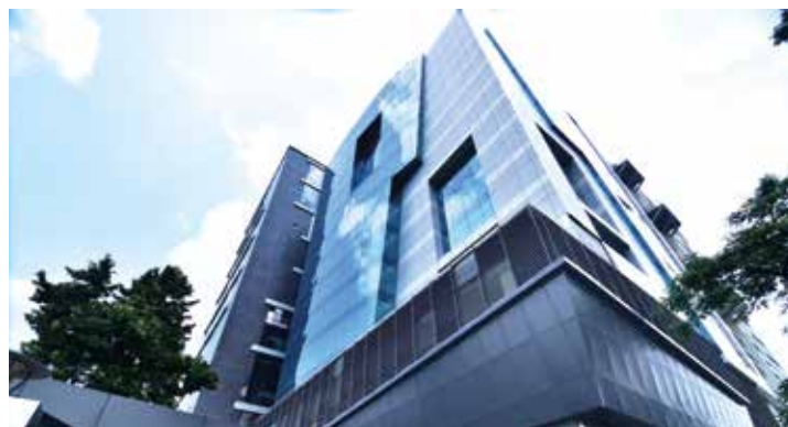
SRIJAN TECH PARK Sector V Salt Lake