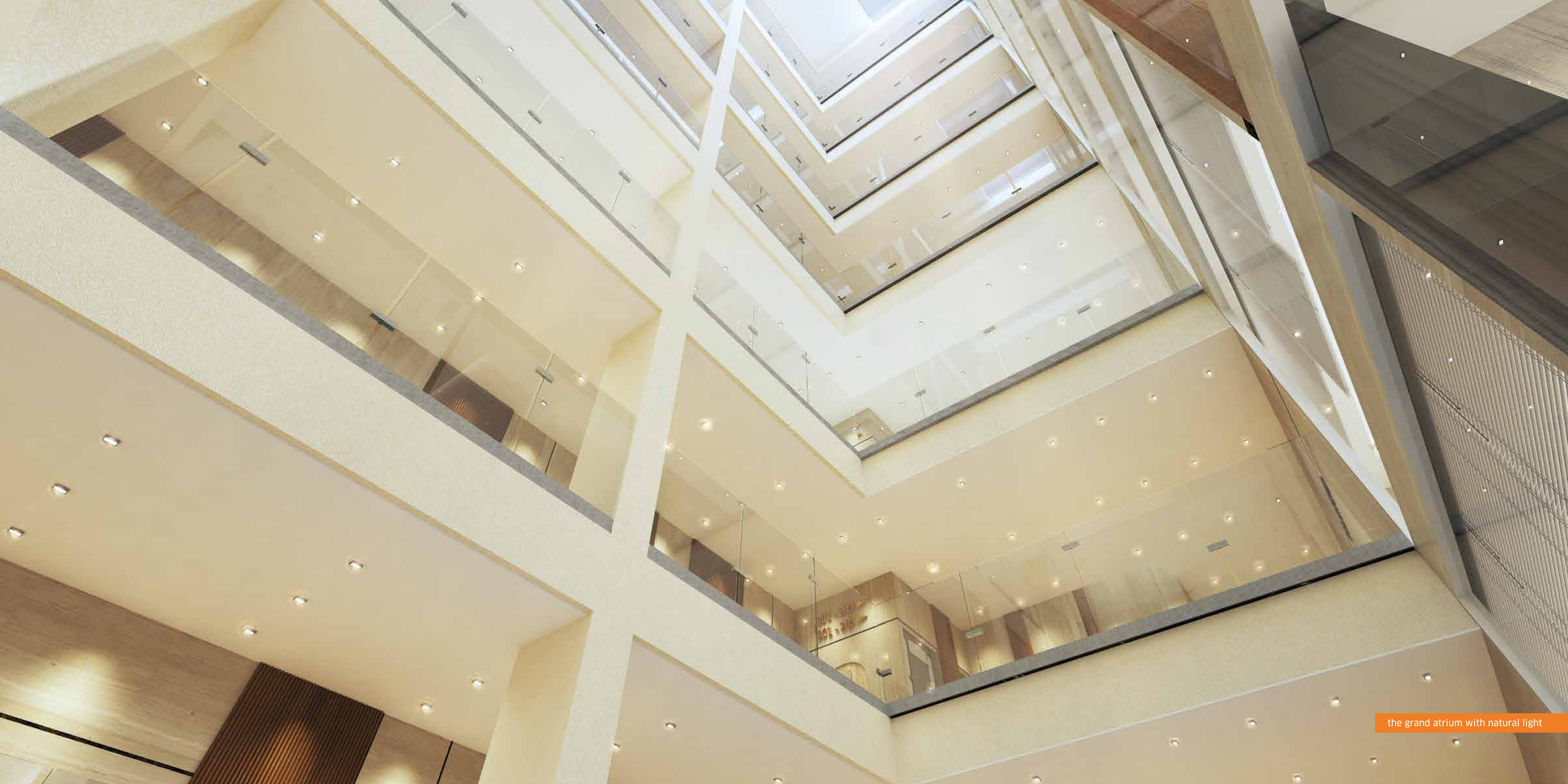
the grand atrium with natural light